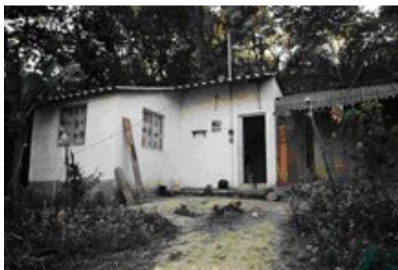
Figure 1: Neoliberalism versus Subsistence