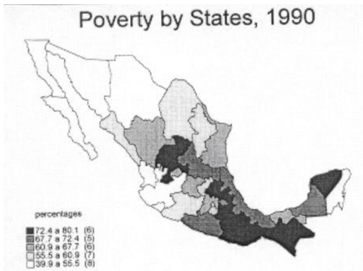
Figure 3: A Comparison of Poverty and Corn