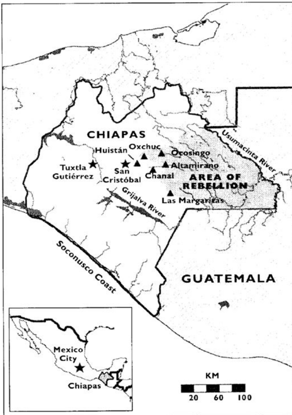
Figure 1. Area of Rebellion