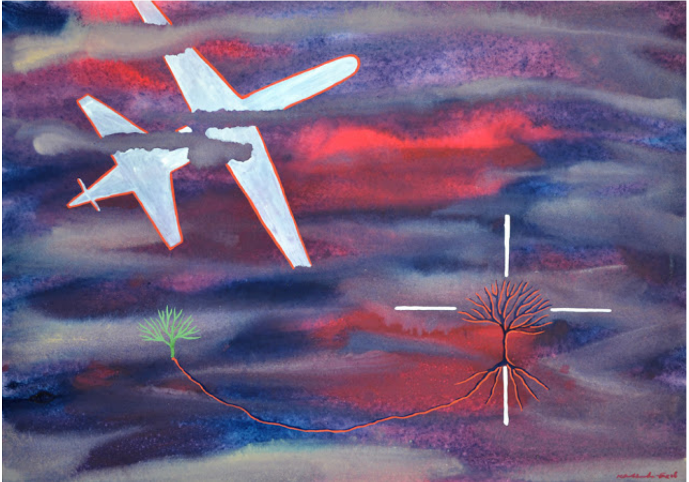
New Shoots Gouache on paper 30 x 42 cm 2016.

fresh new life. During her time living in rural Australia, Brimblecombe-Fox has come to realise the self-regenerating potentials of life. Trees are the emblem of that. Thus, the trees-of-life in Dropescapes aims at sending a message of hope across humanity, an incitement to resist.