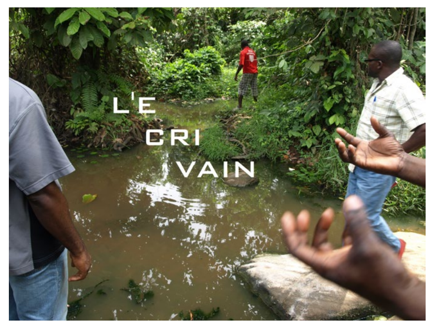
Figure 2: 'L'e Cri Vain'

My commitment to post-/decolonial praxis is centred upon the concurrent need to (i) critique the colonial geopolitics of knowledge that sustains the 'coloniality of power' as well as to (ii) "learn ... from" those who are living in and thinking from colonial and postcolonial legacies' (Mignolo 2000: 5). Herein, I offer reflections on complexities characteristic of the pursuit of decolonial ethics while seeking knowledge on the ground, during exchanges with people.<sup>1</sup> A range of intellectual efforts have sought to 'decolonise knowledge' and yet many times such efforts are made with little specification of the exact processes crucial for the decolonisation of the knowledge regimes at the centre of the (post)colonial global order (Shilliam 2014). Addressing Nadine's critique, I draw from heterogeneous post-/decolonial thought to outline a holistic decolonial ethos (or, an orientation) that critiques and moves toward the creation of epistemes against la langue de la bouche. I understand my efforts as part of a larger collective energy to decolonise knowledge and think at the borders (Anzaldúa 1999), or what Walter Mignolo (2000: 5) describes as 'creating a locus of enunciation where different ways of knowing and individual and collective expressions mingle.'