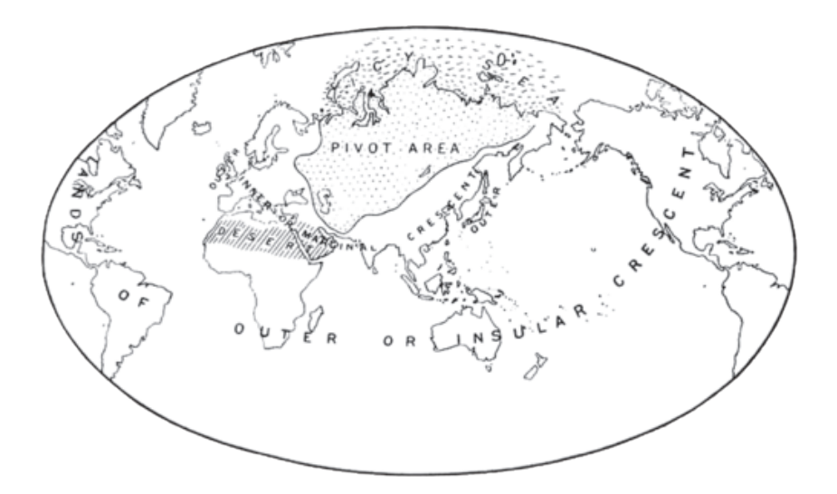
Figure 1: Halford J. Mackinder's Heartland Theory map, as published in 1904