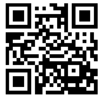
Fig. 5.3: QR codes are images that users can scan with a device such as a phone in order to gain information. Such codes can be printed and placed in real space to give users entry into Cyberspace. The QR code pictured opens a

Cyberspace is not like the global commons as portrayed by Schmitt. Schmitt claims that the "sea is free" and that "[o]n the open sea there were no limits, no boundaries, no consecrated sites, no sacred orientations, no law, and no property." Schmitt is asserting that the governance structure of global commons excludes these spaces for their lack of geography. This is why the 'borderless world' rhetoric is a poor description of Cyberspace. It deprives it of geography. Cyberspace does not lack "sacred orientations." Quite the opposite, Cyberspace is increasingly becoming a waymarker for individuals moving in real space. Such waymarkers include phrases like "Google it"; the use of Twitter as a locus for action in traditional news coverage; and, possibly most starkly, the proliferation of printed QR codes that serve as physical doors to places in Cyberspace (see Fig 5.1).