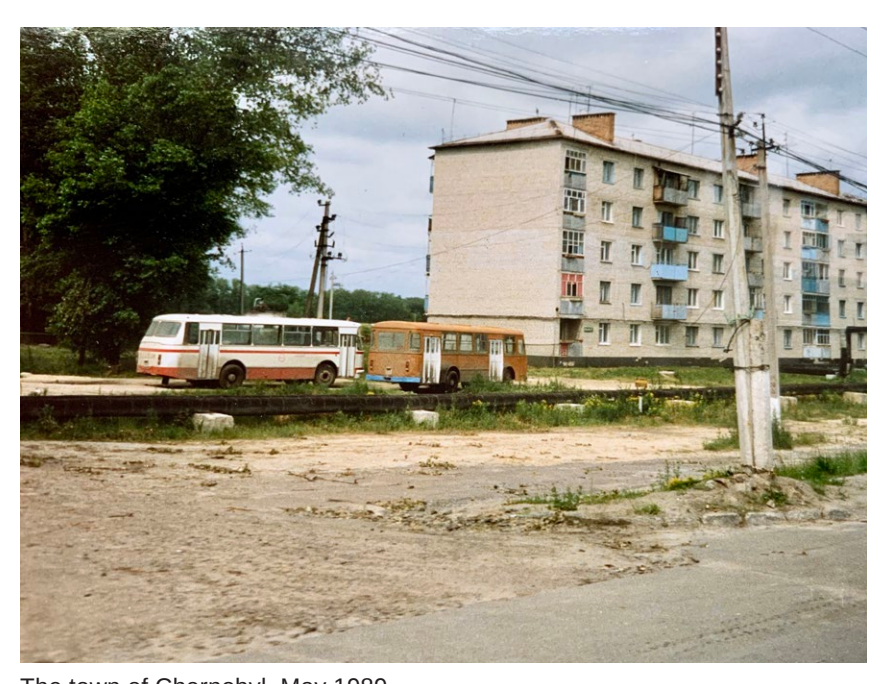
The town of Chernobyl, May 1989.