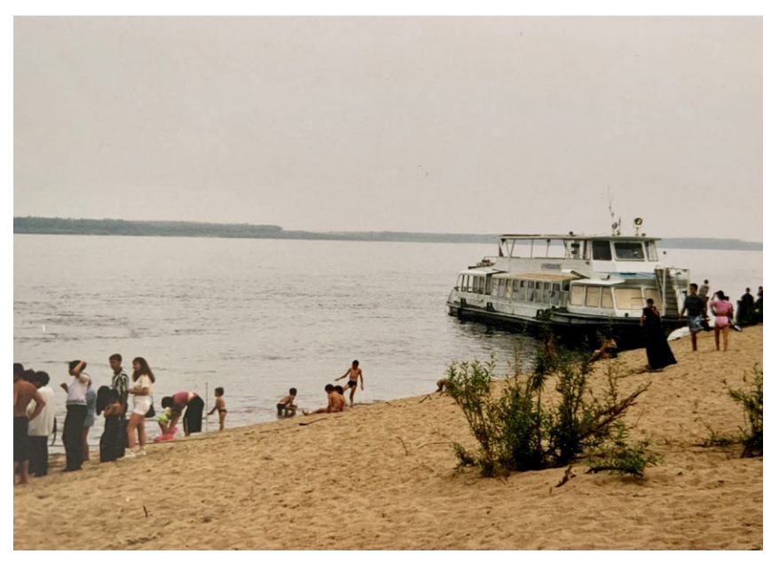
Ferryboat on the Lena River, summer 1998.