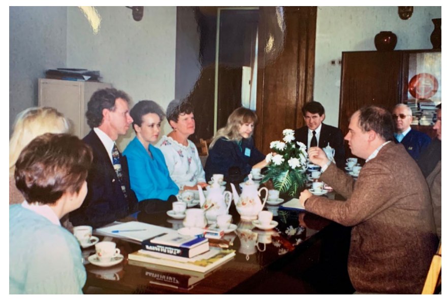
Discussion with the Belarusian Friendship Society, Minsk, 1997.