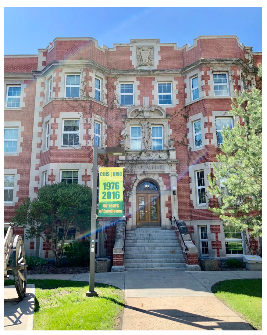
Entrance to the Canadian Institute of Ukrainian Studies (CIUS), Pembina Hall, University of Alberta.