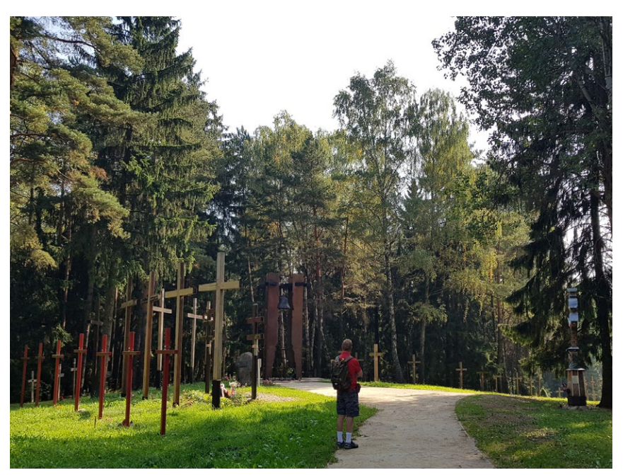
The author at the Kurapaty monument in 2019