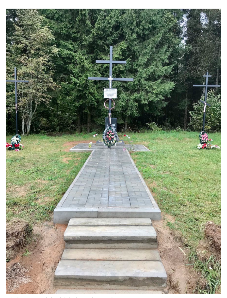
Chajsy memorial, Viciebsk Region, Belarus