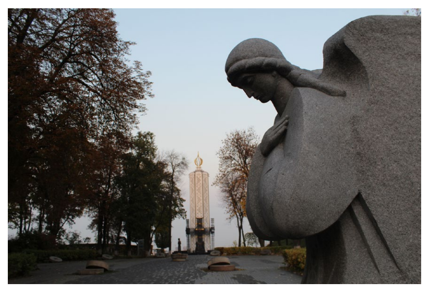
Holodomor Memorial, Kyiv