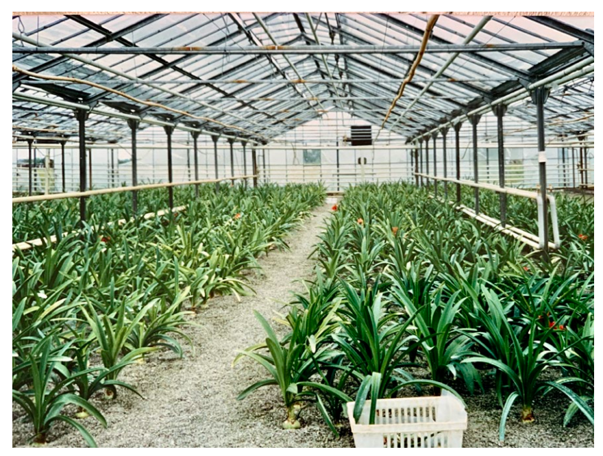
Prypiat hothouse, 1989.