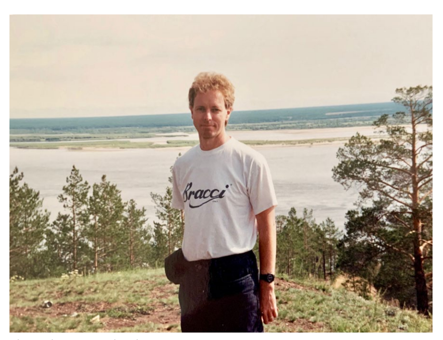
The author near Yakutsk, 1998.