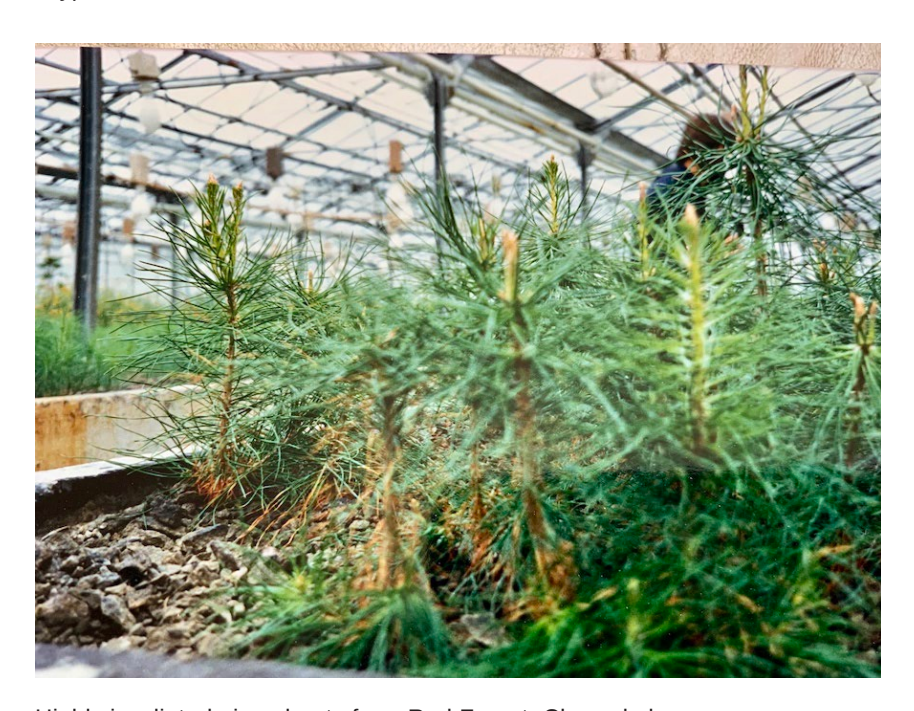
Highly irradiated pine shoots from Red Forest, Chernobyl.